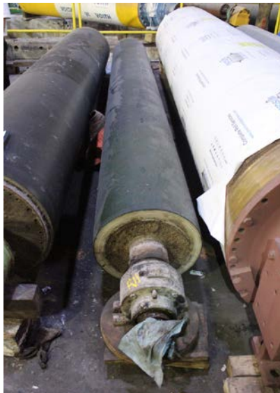
Spare Forming Roll