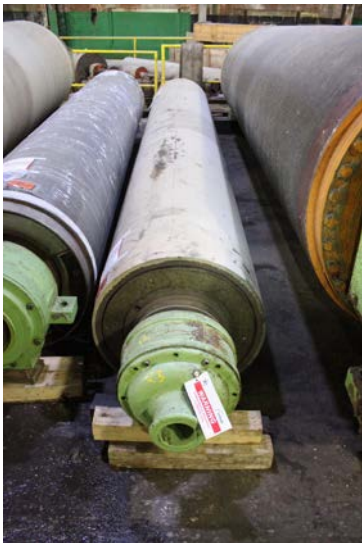
6303B- Main Press Top Roll