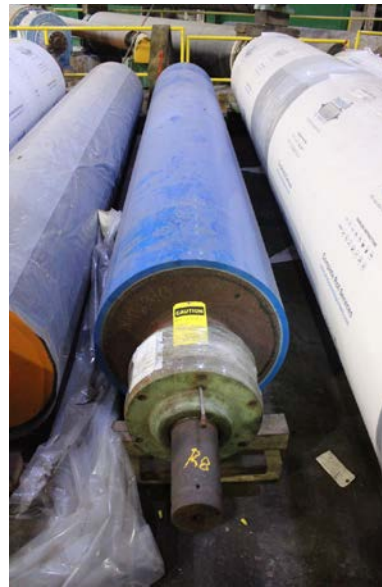
6302- 4 th primary top roll Rubber covered