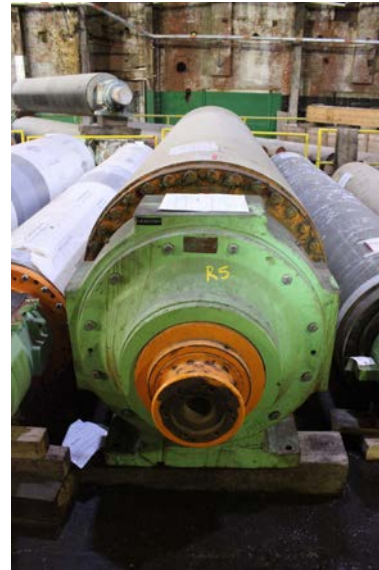
6505B 2 nd or 3 rd Main Press Top Roll