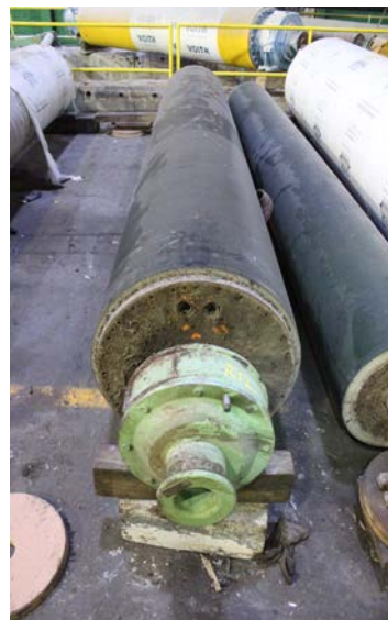
6309- 2 nd Primary Top Roll