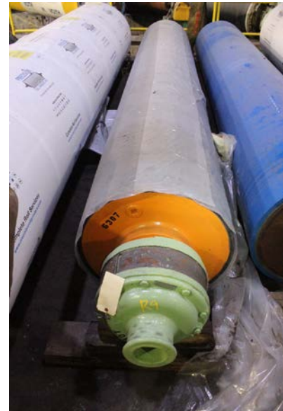
6307- 3 rd Primary Bottom Roll