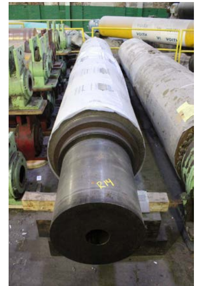
Spare dry stack King Roll