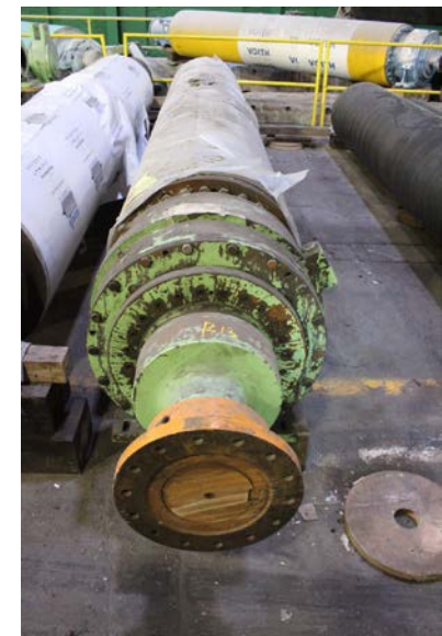
Wet- Stack CC Roll Spare