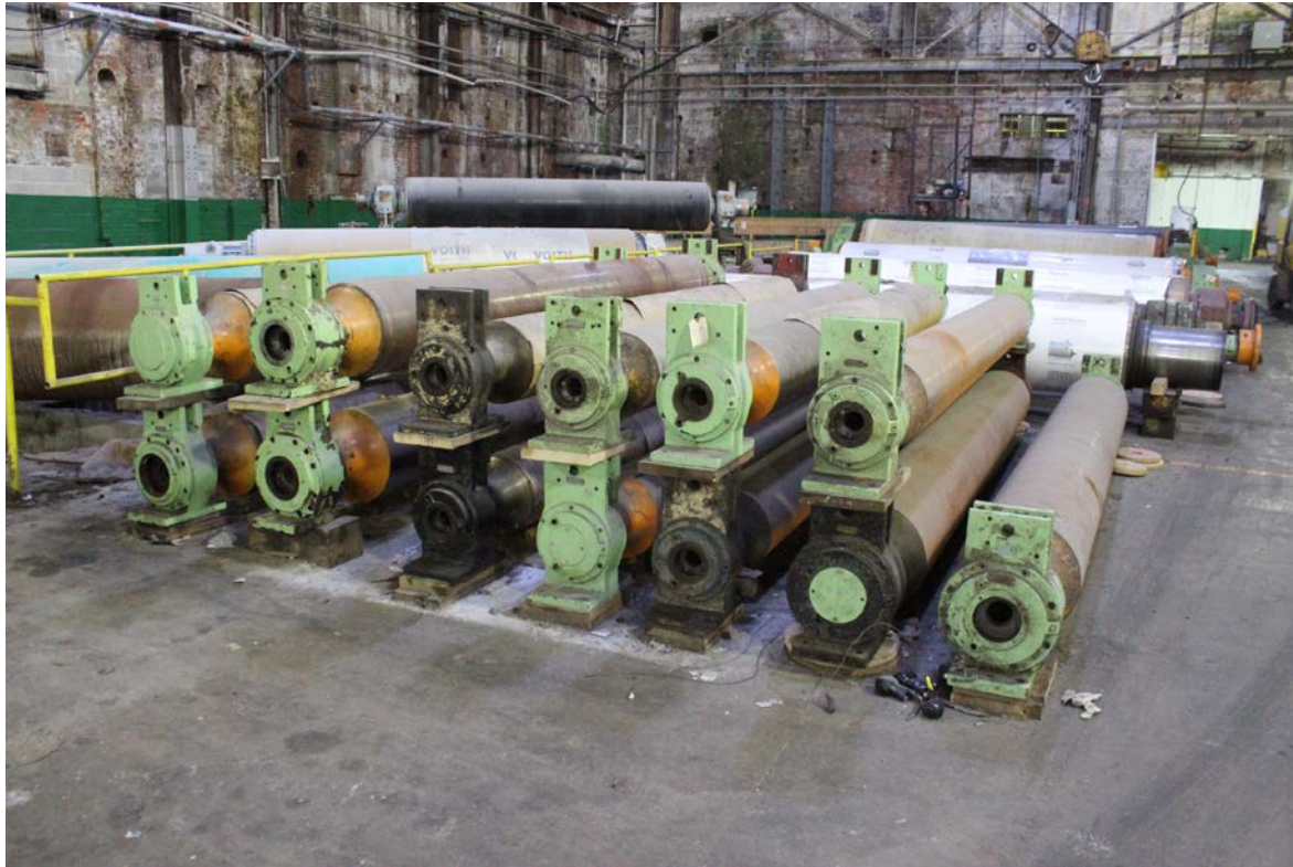
(7) Intermediate Calender Rolls, (6) Spare Queen Rolls Interchangeable for Wet Stack and Dry Stack