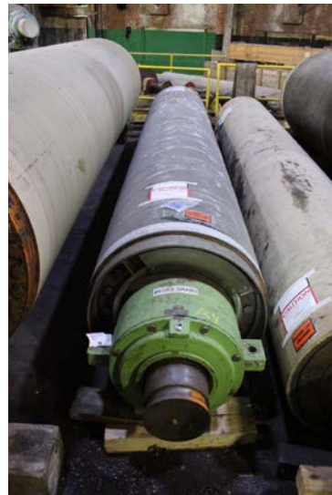
6502- Xerium Smart Roll Main Press Bottom Roll