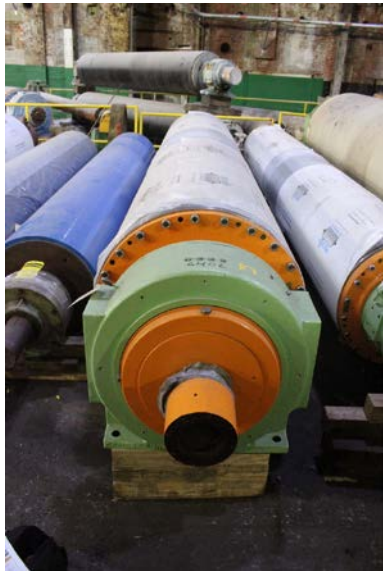
6406- 4 th Primary Bottom Suction Roll