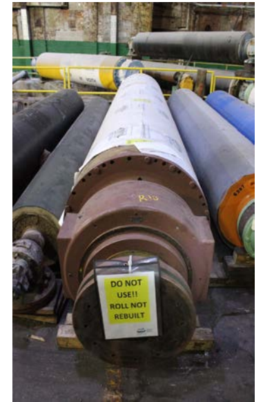
6401- Suction Drum Roll