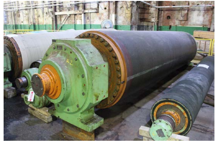
6505A – 3 rd Main Press Bottom Roll