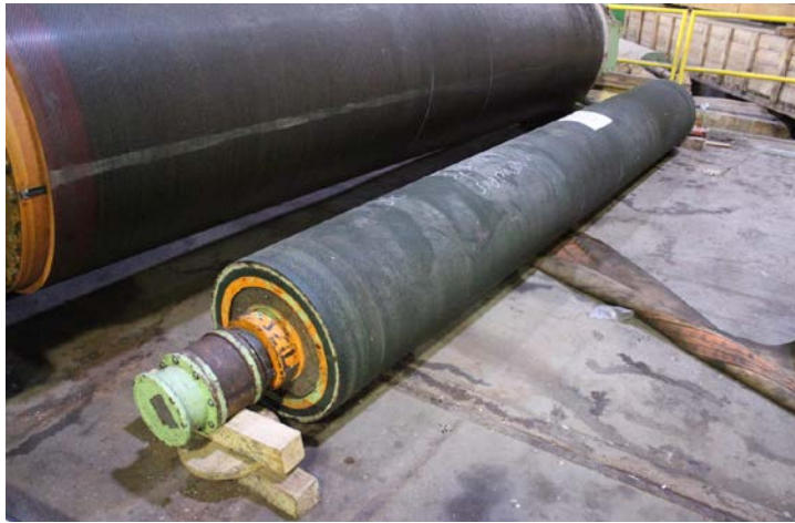
6320- Suction Drum Rider Roll